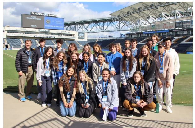
SHHS Marketing Class took a trip to Subaru Park for the Work-in-Sports Camp sponsored by Widener University and Philadelphia Union!