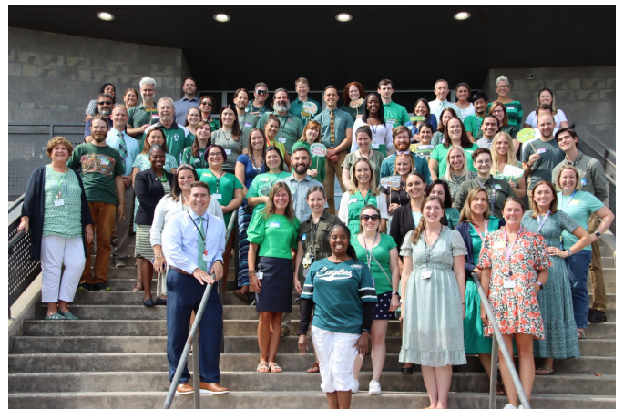
Middle school faculty and staff wear green to support "Say Hello Day" to encourage saying "Hello" to make sure no one feels alone.