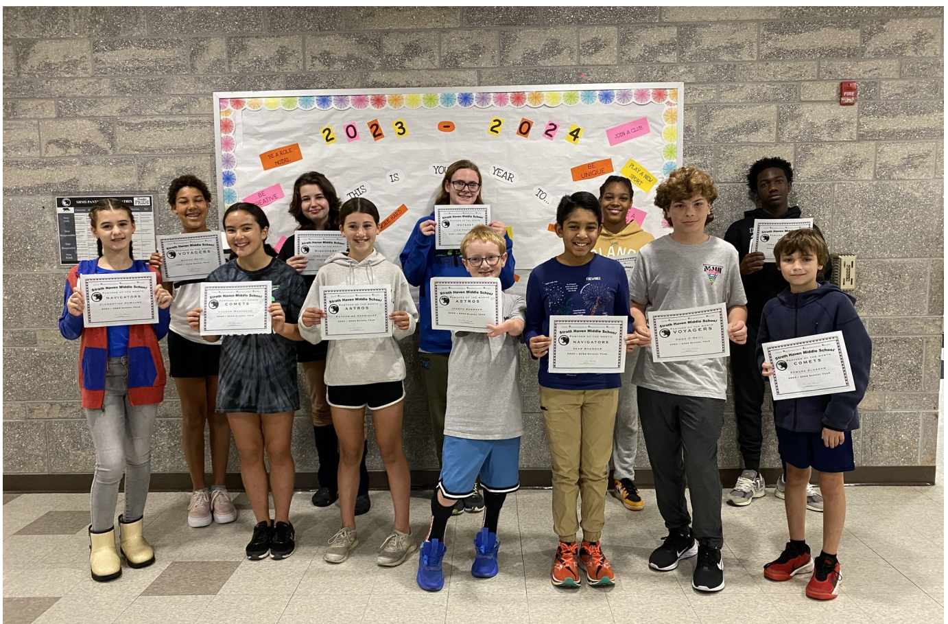
Strath Haven Middle School's September Panthers of the month.

The annual Strath Haven High School Orientation event is offered to the parents and guardians of rising ninth grade students in March of their eighth grade year. The event is held in the Strath Haven High School auditorium and is led by members of our high school administration. During this event, the Strath Haven High School Principal talks about the high school's mission, discusses how students can and should get involved, and also presents an overview of academic requirements in high school, as well as the social-emotional/academic balance they work to provide for their students. The High School Assistant Principal also reviews the scheduling process. All high school department chairs are introduced and discuss their content areas. All presenters then remain available for questions and answers following the formal presentation. The following day in school, the topic of scheduling and course selection for the high school is reviewed with the eighth grade students by the high school school counseling department.