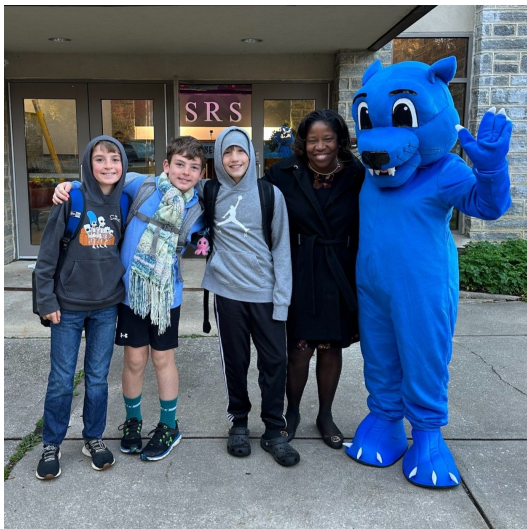
Perry the Panther Cub came to visit SRS to reinforce the three Bs – being safe, being respectful and being responsible – with our students!

Botvin Life Skills Parent Training is a comprehensive substance abuse prevention program that focuses on targeting the social and psychological factors that initiate risky behaviors rather than simply educating participants on the dangers of drug and alcohol use. It helps students to develop greater self-esteem and self-confidence and to effectively cope with anxiety. Parents are provided with information and strategies to help support their children as they grow up and face various challenges. This program helps give children the tools to make good choices. The program focuses on these 8 components and builds on them throughout the 3rd through 5th grade: Self esteem, Decision making, smoking, advertising, dealing with stress, communication skills, social skills, and assertiveness.