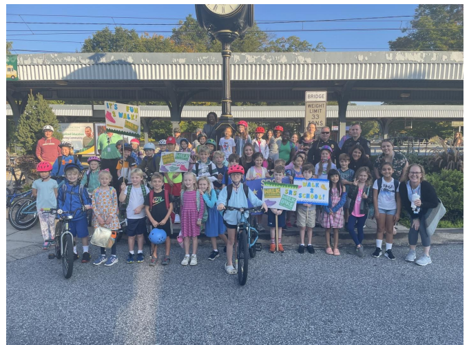
A photo from National Walk, Bike, or Roll to School Day! Students at SRS took on the streets around Swarthmore College to start their journey to school! WES also encouraged students to walk, bike, or roll to school today with our amazing crossing guards helping our students travel safely!

WSSD administrators communicate any parent and community feedback that has been brought to our district's Central or Building-level Administrative team regarding behavioral health services to the Counseling Department through regular department meetings. At each level, counselors meet with their building administrators on a weekly basis. At the high school, counselors work in triad teams with an administrator and a behavioral health counselor. That triad team meets weekly.