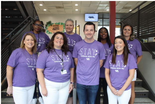
Members of our Student Services department show their support for Suicide Prevention month.

The district is collaborating with parents and other community members to offer a Wellness Day for our staff. The focus of this day will be both physical and mental health for the district employees. WSSD employees will participate in a wide range of offerings to suit their personal holistic health needs.