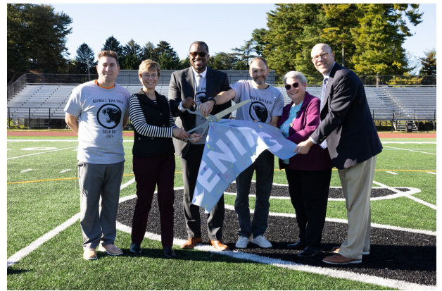
Some familiar faces around WSSD cut the ribbon for the grand reopening of King Field.

Through collaboration with the Strath Haven Home and School Association, the Counseling Department gathers feedback from parents about Counseling needs. School and Behavioral Health Counselors present at least three times a year at Home and School meetings on a range of topics, and communicate frequently throughout the year with the Home and School Representatives.