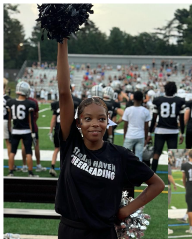
School spirit on display from our SHHS cheerleaders!