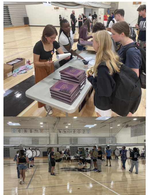
Strath Haven High School celebrated its inaugural “Panther Pride” Kickoff Event this fall, culminating in the 2022-23 yearbook distribution.